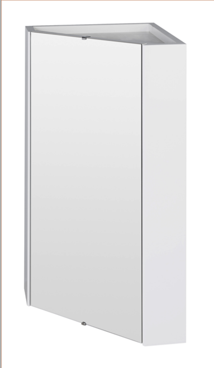
NVC118 - CORNER MIRROR CABINET

Description: Corner Mounted Mirror Cabinet