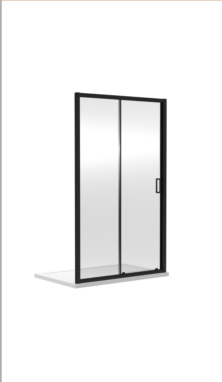
SQ Slider Enclosure

Description: 1200X1850mm Sliding Shower Door