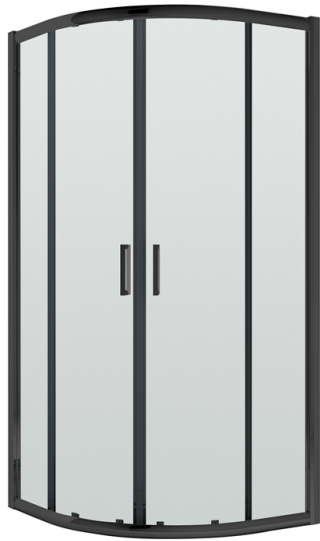
SQ Quadrant Enclosure

Description: 900X900x1850mm Quadrant Enclosure